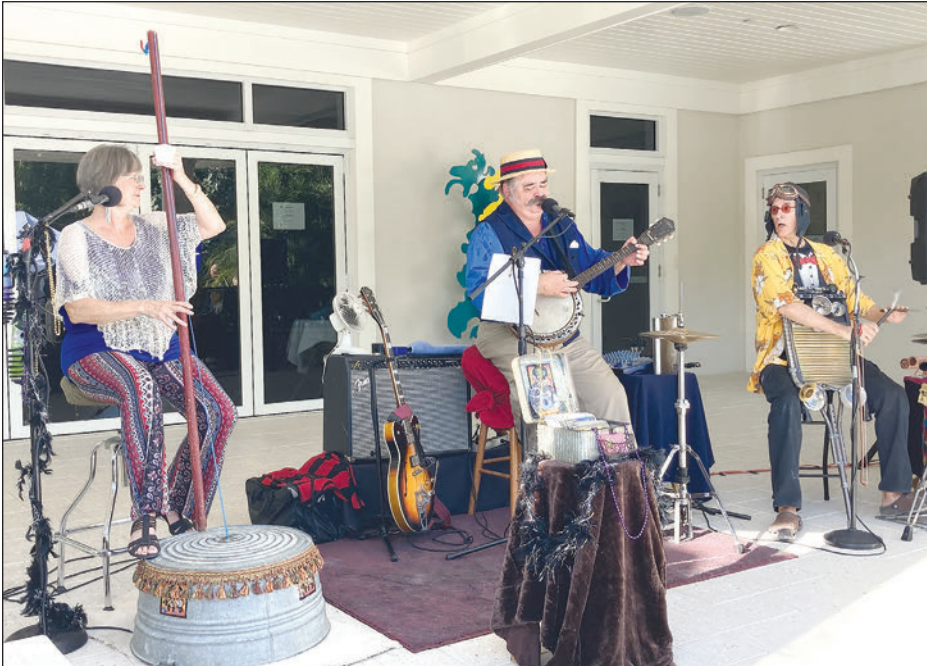
The band The Hot Buttered Nuggets entertains the crowd at the Captiva Civic Association