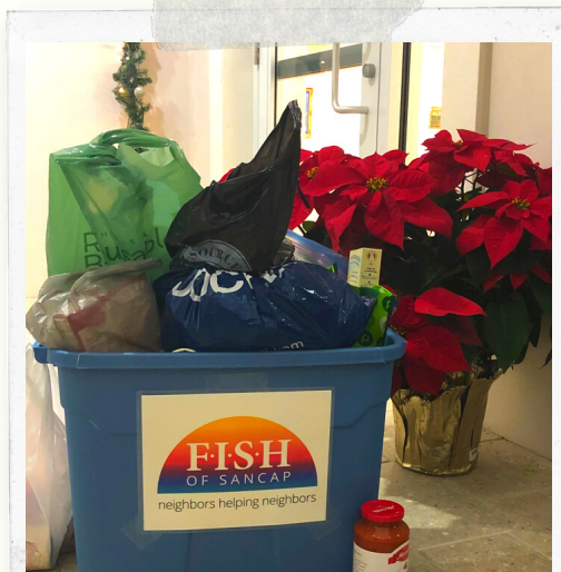
Donations collected at our Tingle & Mingle event

F.I.S.H. of Sanibel-Captiva cares for island community members in need. Please bring non-perishables to donate whenever you stop by CCA so we can help with these efforts!